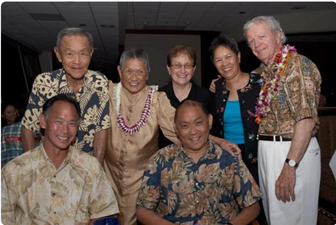
Special occasions with the Liu Family