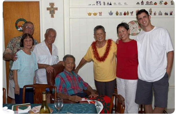
Christmas in Kailua